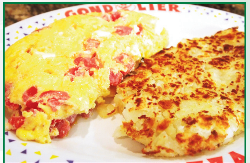
GREEK NO. 1

VEGETARIAN , Mushrooms, Spinach, Broccoli, Red Peppers & Three Cheeses 12.50