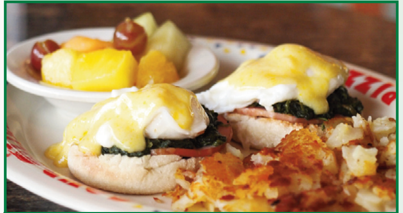
EGGS BENEDICT FLORENTINE

CORNED BEEF HASH with TWO EGGS served with Grilled Potatoes or Grits and Toast 12.50